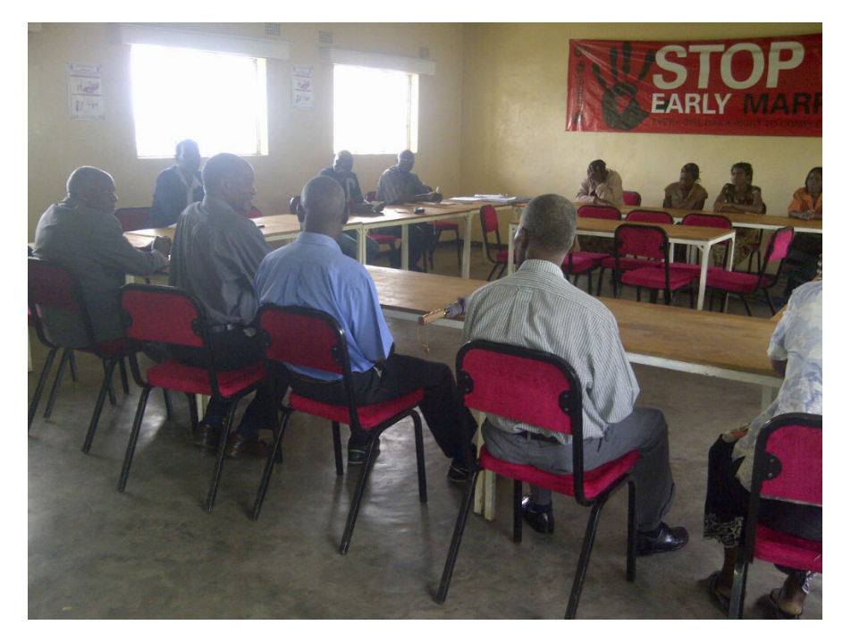
Figure 2: Community members at FGD in Chirimba

Figure 1: Field testing the questionnaire at Bangwe