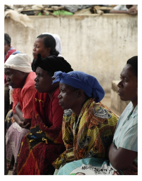
Figure 3: Market committee members at FGD in Chirimba